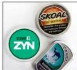
Chew, ZYN, Snus