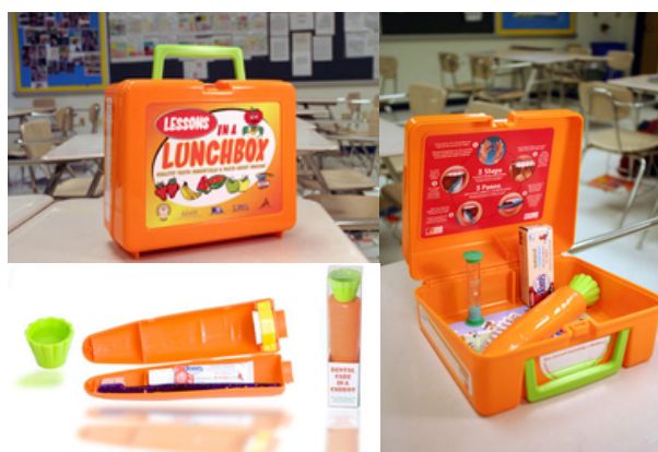
An example of the lunchbox and its contents

The Lessons in a Lunchbox Program has delivered over 65,000 lunchboxes and has been presented in all 50 states. Additionally, retailers Crest + Oral B have featured their free course “Improving Oral Health Literacy: Teaching Primary School Students through the Lessons in a Lunch Box Program” as a Continuing Education Credit. Though the course aims toward dental professionals, any health professional can take the course to learn about proper oral hygiene and to introduce the program to students. A certificate is awarded upon completion.